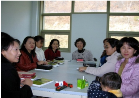
Ladies SEAN Study Group, South Korea

We were recently able to make a grant to ORTA, the group translating, publishing and using SEAN materials in Russia. Their response from Vladivostok was warm, quoting Hudson Taylor: "God's work, done in God's way, will not lack God's supply". Praise God! The £1000 is being used to pay the team of translators working on the Compendium of Pastoral Theology. The ORTA staff regard this as "the basis for the quality of the teaching materials that we provide to the churches".