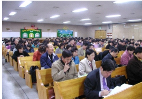
South Korean Military Church

This group is linked to the Military Church. Note the little one in the foreground! It seems they start on SEAN at a young age in Korea!