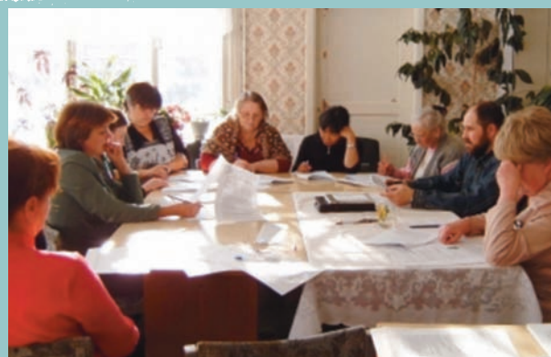
Tutor Training Seminar—Magadan