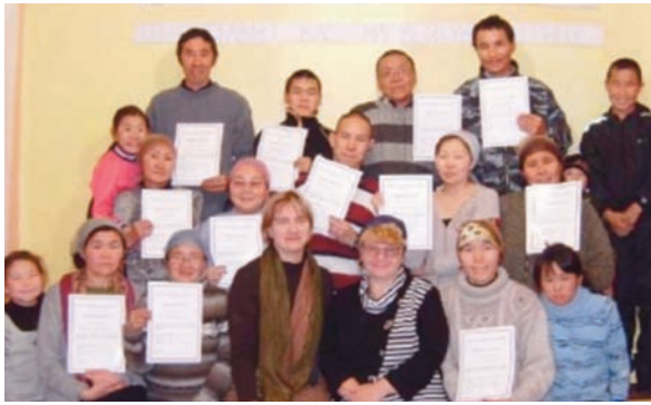
New born tutors at Evensk Church

We left Evensk as soon as we could on the Saturday morning. We reached Magadan with only about 20 minutes to spare to get onto the Vladivostok flight, but we did it alright. It was snowing when we departed and the weather was getting worse. We thankfully got back to Vladivostok that evening!