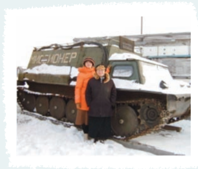
The church's cross country vehicle which is named "The Missionary"!

POSTSCRIPT —To illustrate part of the history of this region, we include two more photos of Magadan. Both are reminders of the tens of thousands of mostly innocent people who suffered and died in the gulag prison camps there during the 1930's, 40's and 50's. On the left is Nagaevo Bay with the quay where prisoners were unloaded from the boats on their way to the prison camps.