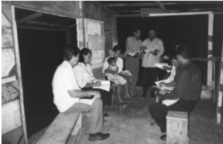
Indigenous People in a SEAN Group in Panama